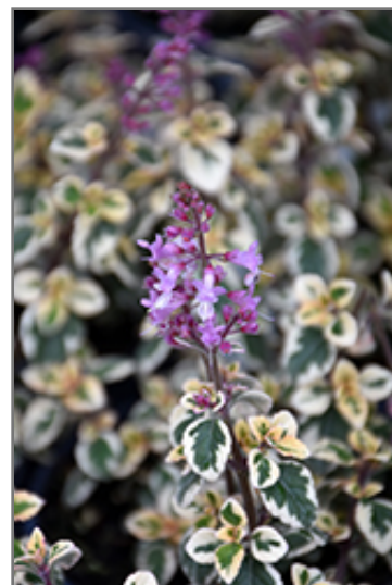
Candy Kisses Wild Sage flowers