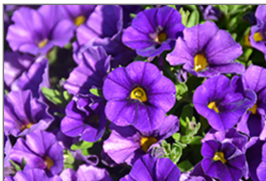
Catwalk Perfect Purple Calibrachoa flowers

Catwalk Perfect Purple Calibrachoa is recommended for the following landscape applications;