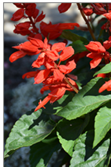
Ablazin' Tabasco Sage flowers

Ablazin' Tabasco Sage is recommended for the following landscape applications;