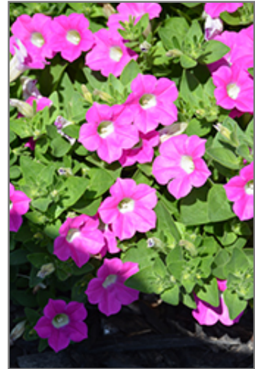
Blanket Rose Petunia flowers

Blanket Rose Petunia is recommended for the following landscape applications;