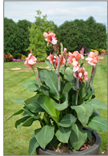
Toucan Coral Canna in bloom

Toucan Coral Canna is a fine choice for the garden, but it is also a good selection for planting in outdoor pots and containers. With its upright habit of growth, it is best suited for use as a 'thriller' in the 'spiller-thriller-filler' container combination; plant it near the center of the pot, surrounded by smaller plants and those that spill over the edges. It is even sizeable enough that it can be grown alone in a suitable container. Note that when growing plants in outdoor containers and baskets, they may require more frequent waterings than they would in the yard or garden.