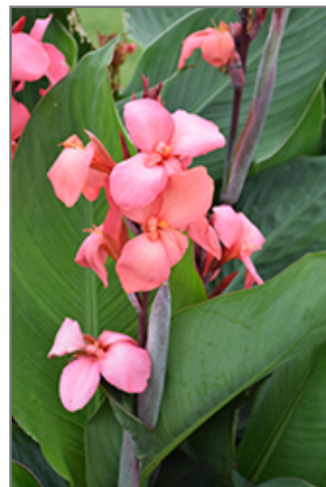
Toucan Coral Canna flowers