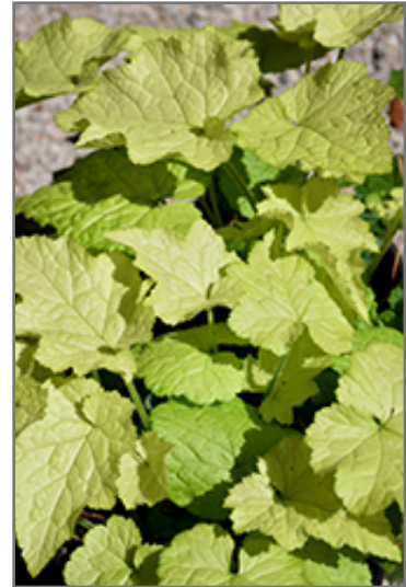
Cool Gold Piggyback Plant foliage

When grown indoors, Cool Gold Piggyback Plant can be expected to grow to be about 16 inches tall at maturity extending to 24 inches tall with the flowers, with a spread of 5 feet. It grows at a fast rate, and under ideal conditions can be expected to live for approximately 10 years. This houseplant performs well in both bright or indirect sunlight and strong artificial light, and can therefore be situated in almost any well-lit room or location. It prefers to grow in average to moist soil. The surface of the soil shouldn't be allowed to dry out completely, and so you should expect to water this plant once and possibly even twice each week. Be aware that your particular watering schedule may vary depending on its location in the room, the pot size, plant size and other conditions; if in doubt, ask one of our experts in the store for advice. It is not particular as to soil type, but has a definite preference for acidic soil. Contact the store for specific recommendations on pre-mixed potting soil for this plant.