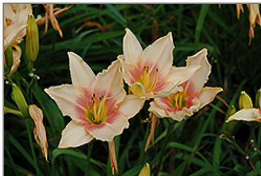
Broadmoor Delight Daylily flowers

Broadmoor Delight Daylily is recommended for the following landscape applications;