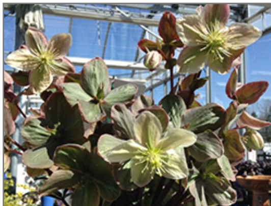
Winter Sunshine Hellebore flowers