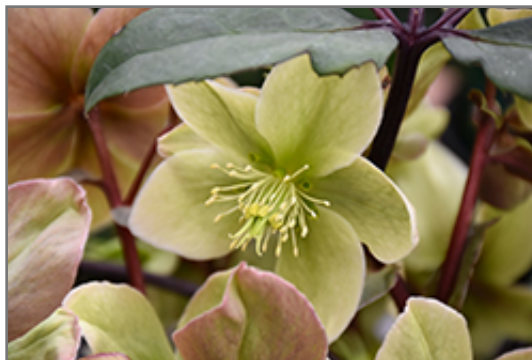
Winter Sunshine Hellebore flowers

Winter Sunshine Hellebore is recommended for the following landscape applications;