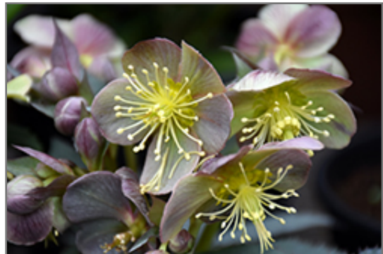
Silver Dollar Hellebore flowers