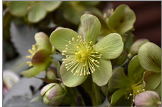
Silver Dollar Hellebore flowers

Silver Dollar Hellebore is recommended for the following landscape applications;