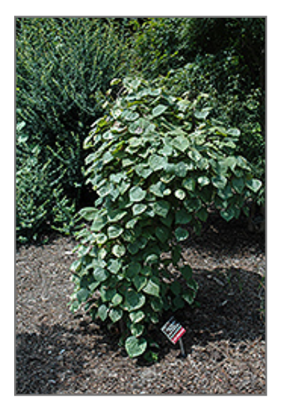
Whitewater Redbud

Whitewater Redbud is recommended for the following landscape applications;