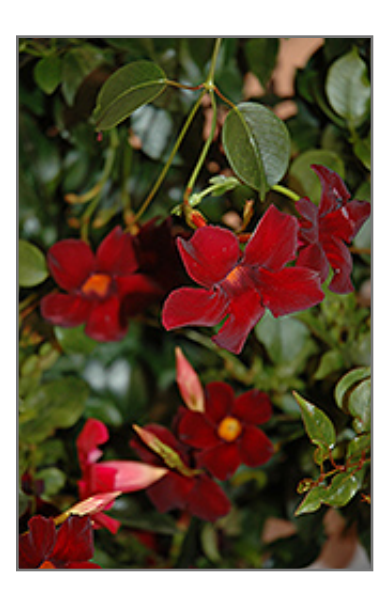
Sun Parasol Pretty Deep Red Mandevilla flowers

When grown indoors, Sun Parasol Pretty Deep Red Mandevilla can be expected to grow to be about 10 feet tall at maturity, with a spread of 24 inches. It grows at a medium rate, and under ideal conditions can be expected to live for approximately 20 years. This houseplant will do well in a location that gets either direct or indirect sunlight, although it will usually require a more brightly-lit environment than what artificial indoor lighting alone can provide. It requires an evenly moist well-drained soil for optimal growth. The surface of the soil shouldn't be allowed to dry out completely, and so you should expect to water this plant once and possibly even twice each week. Be aware that your particular watering schedule may vary depending on its location in the room, the pot size, plant size and other conditions; if in doubt, ask one of our experts in the store for advice. It is not particular as to soil type or pH; an average potting soil should work just fine. Be warned that parts of this plant are known to be toxic to humans and animals, so special care should be exercised if growing it around children and pets.