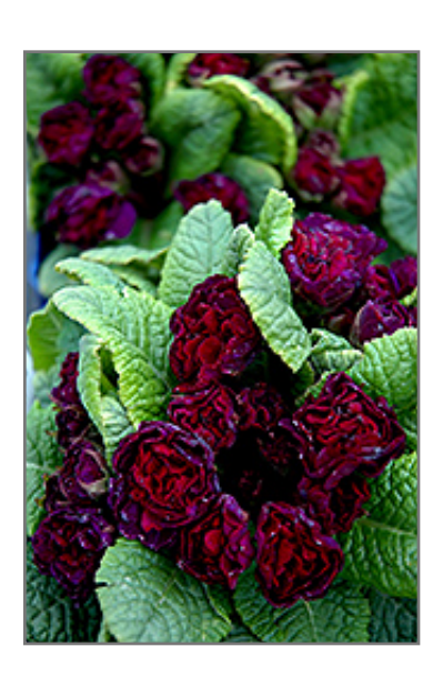
Miss Indigo Primrose flowers

When grown indoors, Miss Indigo Primrose can be expected to grow to be only 5 inches tall at maturity, with a spread of 8 inches. It grows at a fast rate, and under ideal conditions can be expected to live for approximately 5 years. This houseplant performs well in both bright or indirect sunlight and strong artificial light, and can therefore be situated in almost any well-lit room or location. It requires an evenly moist well-drained soil for optimal growth, but will suffer if left to grow in standing water. The surface of the soil shouldn't be allowed to dry out completely, and so you should expect to water this plant once and possibly even twice each week. Be aware that your particular watering schedule may vary depending on its location in the room, the pot size, plant size and other conditions; if in doubt, ask one of our experts in the store for advice. It is not particular as to soil type or pH; an average potting soil should work just fine.