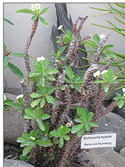
Tall White Crown Of Thorns in bloom