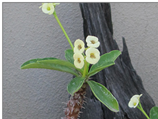
Tall White Crown Of Thorns flowers

This is a multi-stemmed evergreen houseplant with a narrowly upright and columnar growth habit. This plant may benefit from an occasional pruning to look its best.