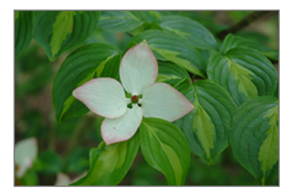
Gold Cup Chinese Dogwood flowers

A lovely upright dogwood presenting glossy green leaves with striking golden centers; covered in white blooms for several weeks in late spring, followed by berries in fall; vigorous and tolerant of most soils except very wet or dry