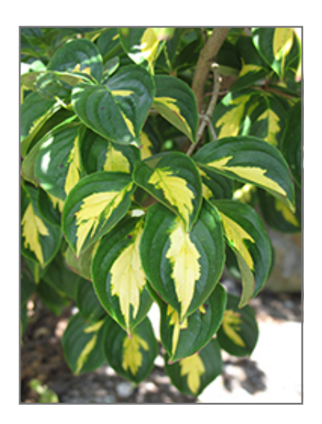
Gold Cup Chinese Dogwood foliage

Gold Cup Chinese Dogwood is recommended for the following landscape applications;