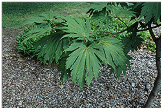
Yama Kagi Fullmoon Maple foliage