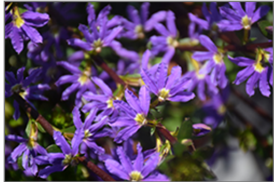
Paper Doll Top Model Fan Flower flowers