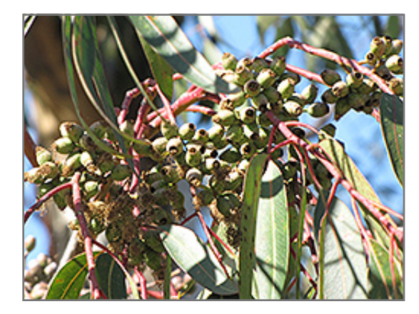
Narrow-Leaved Peppermint fruit