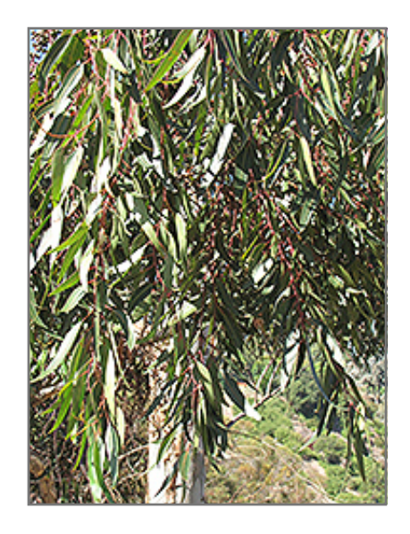
Narrow-Leaved Peppermint foliage

This tree should only be grown in full sunlight. It does best in average to evenly moist conditions, but will not tolerate standing water. It is particular about its soil conditions, with a strong preference for sandy, acidic soils, and is able to handle environmental salt. It is somewhat tolerant of urban pollution. This species is not originally from North America.