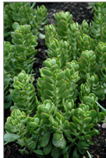
Red Carpet