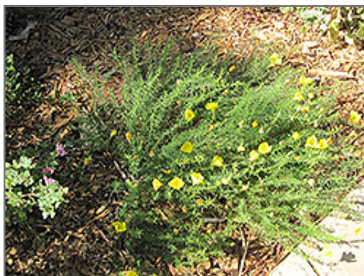
Hartweg's Sundrops in bloom

Hartweg's Sundrops is recommended for the following landscape applications;