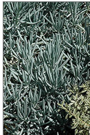
Blue Chalk Sticks foliage