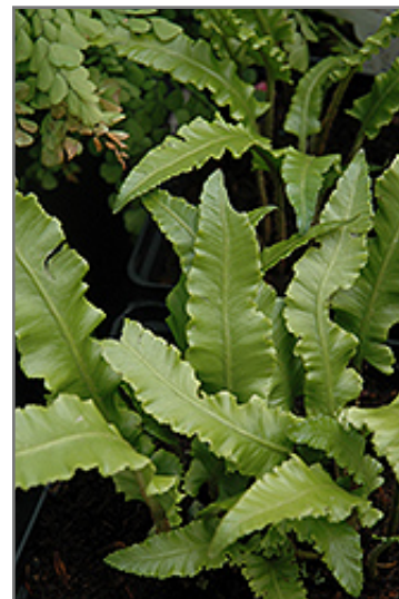
Crested Hart's Tongue Fern foliage