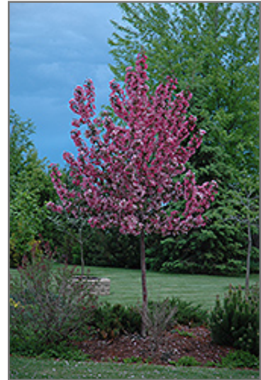
Rudolph Flowering Crab in bloom

Rudolph Flowering Crab is recommended for the following landscape applications;