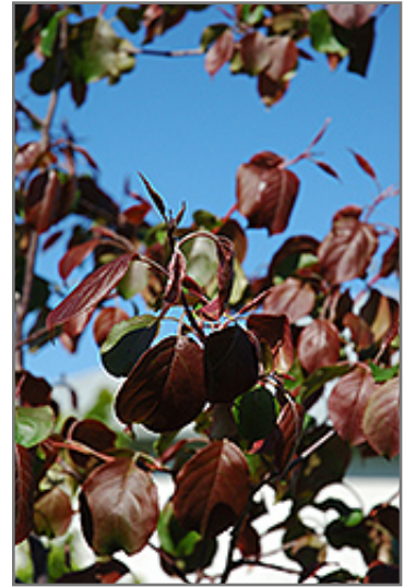
Rudolph Flowering Crab foliage

This tree should only be grown in full sunlight. It prefers to grow in average to moist conditions, and shouldn't be allowed to dry out. It is not particular as to soil type or pH. It is highly tolerant of urban pollution and will even thrive in inner city environments. This particular variety is an interspecific hybrid.