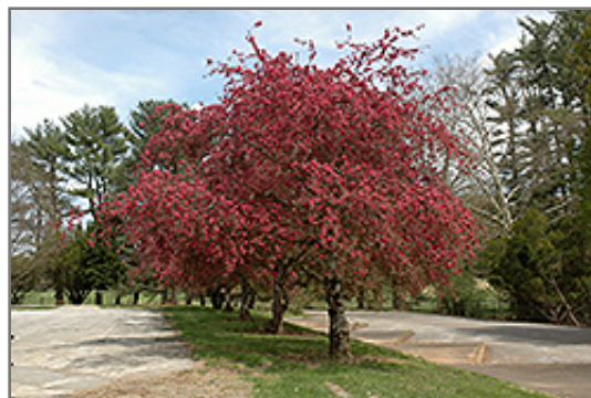
Purple Flowering Crab in bloom