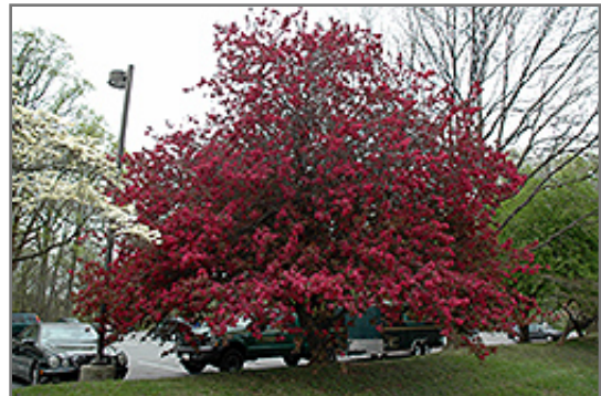
Burgundy Flowering Crab in bloom

Burgundy Flowering Crab is recommended for the following landscape applications;