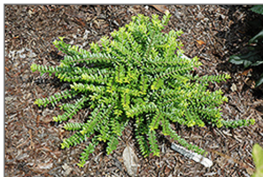
Ophelia Box Honeysuckle