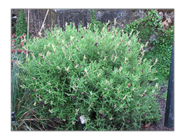
Lemon Leigh Lavender in bloom

This is a relatively low maintenance shrub, and can be pruned at anytime. It is a good choice for attracting bees and butterflies to your yard, but is not particularly attractive to deer who tend to leave it alone in favor of tastier treats. It has no significant negative characteristics.