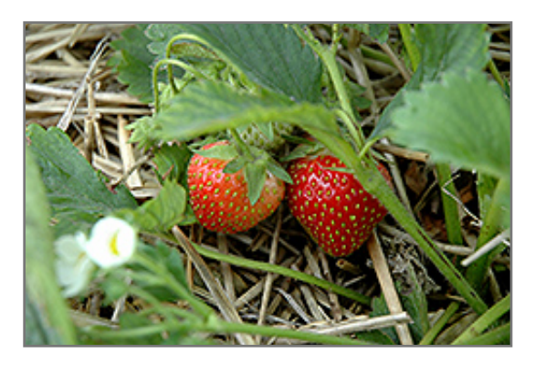
Sable Strawberry fruit

This is an open herbaceous perennial with a spreading, ground-hugging habit of growth. Its relatively fine texture sets it apart from other garden plants with less refined foliage. This is a high maintenance plant that will require regular care and upkeep, and should not require much pruning, except when necessary, such as to remove dieback. It is a good choice for attracting birds to your yard, but is not particularly attractive to deer who tend to leave it alone in favor of tastier treats. Gardeners should be aware of the following characteristic(s) that may warrant special consideration;