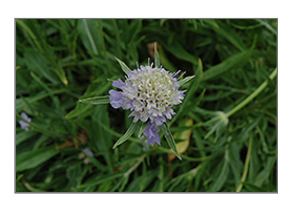
Perfecta Blue Pincushion Flower flowers