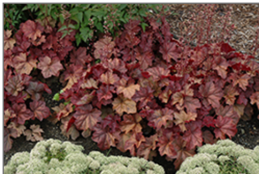
Lava Lamp Coral Bells

Lava Lamp Coral Bells will grow to be about 16 inches tall at maturity extending to 32 inches tall with the flowers, with a spread of 28 inches. When grown in masses or used as a bedding plant, individual plants should be spaced approximately 24 inches apart. Its foliage tends to remain dense right to the ground, not requiring facer plants in front. It grows at a medium rate, and under ideal conditions can be expected to live for approximately 10 years. As an evergreen perennial, this plant will typically keep its form and foliage year-round.