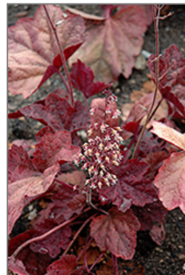
Lava Lamp Coral Bells flowers