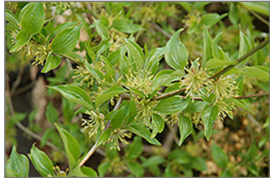
Lemon Zest Japanese Cornelian Dogwood flowers

Lemon Zest Japanese Cornelian Dogwood is recommended for the following landscape applications;