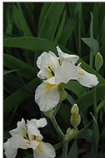
Mystic Crystal Iris flowers