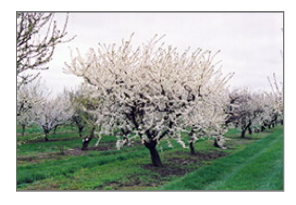
Vanier Plum in bloom