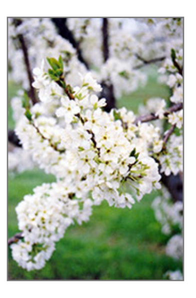
Vanier Plum flowers

Vanier Plum will grow to be about 20 feet tall at maturity, with a spread of 20 feet. It has a low canopy with a typical clearance of 4 feet from the ground, and is suitable for planting under power lines. It grows at a medium rate, and under ideal conditions can be expected to live for 40 years or more. This variety requires a different selection of the same species growing nearby in order to set fruit.