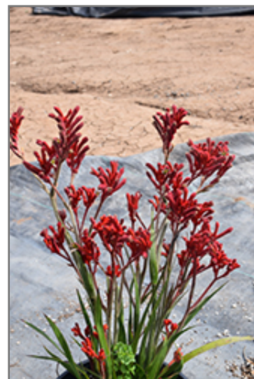
Kanga Red Kangaroo Paw in bloom