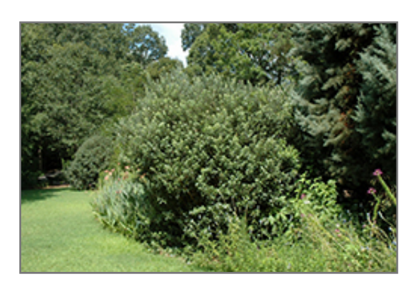
Pineapple Guava