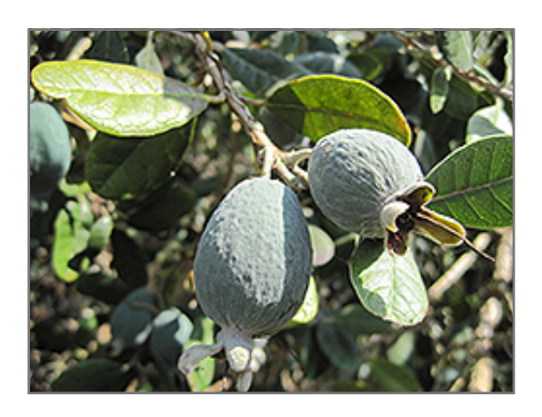
Pineapple Guava fruit

Pineapple Guava is a good choice for the edible garden, but it is also well-suited for use in outdoor pots and containers. Its large size and upright habit of growth lend it for use as a solitary accent, or in a composition surrounded by smaller plants around the base and those that spill over the edges. It is even sizeable enough that it can be grown alone in a suitable container. Note that when grown in a container, it may not perform exactly as indicated on the tag - this is to be expected. Also note that when growing plants in outdoor containers and baskets, they may require more frequent waterings than they would in the yard or garden.