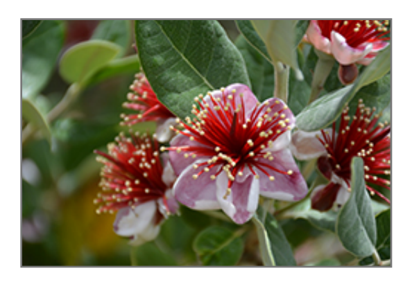
Pineapple Guava flowers

Pineapple Guava features showy white pincushion flowers with pink overtones and red anthers at the ends of the branches from late spring to early summer. It has dark green foliage with gray undersides which emerges light green in spring. The fuzzy oval pinnately compound leaves remain dark green throughout the winter. The fruits are showy green drupes carried in abundance from early summer to mid fall.