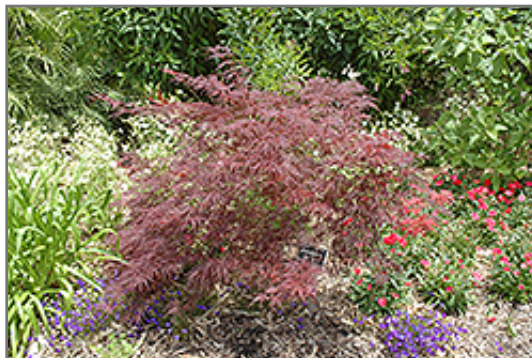
Dissectum Nigrum Cutleaf Japanese Maple