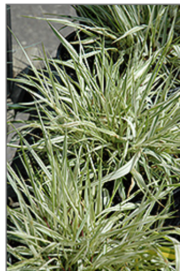
Fubuki Hakone Grass foliage