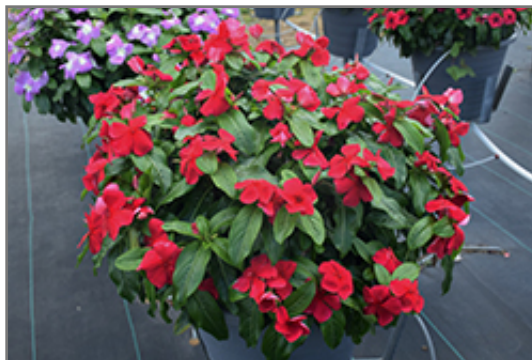
Titan Dark Red Vinca in bloom

Titan Dark Red Vinca will grow to be about 14 inches tall at maturity, with a spread of 12 inches. Its foliage tends to remain dense right to the ground, not requiring facer plants in front. Although it's not a true annual, this fast-growing plant can be expected to behave as an annual in our climate if left outdoors over the winter, usually needing replacement the following year. As such, gardeners should take into consideration that it will perform differently than it would in its native habitat.