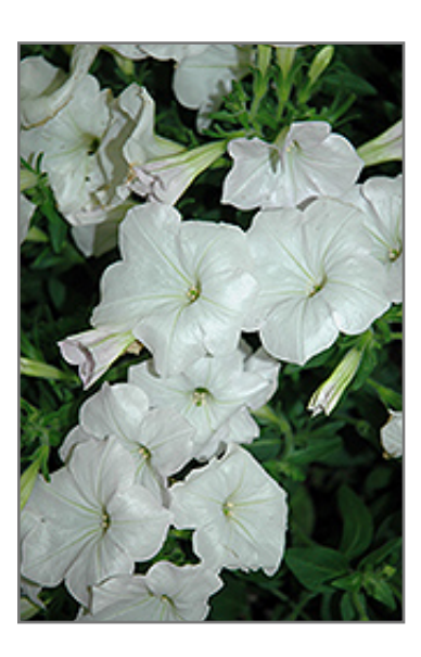
Good And Plenty White Petunia flowers

Good And Plenty White Petunia will grow to be about 10 inches tall at maturity, with a spread of 14 inches. When grown in masses or used as a bedding plant, individual plants should be spaced approximately 10 inches apart. Its foliage tends to remain low and dense right to the ground. This fast-growing annual will normally live for one full growing season, needing replacement the following year.