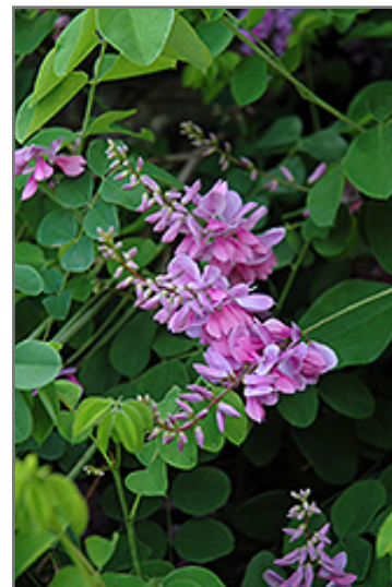
Chinese Indigo flowers