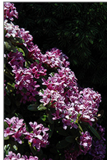
Collina Daphne flowers