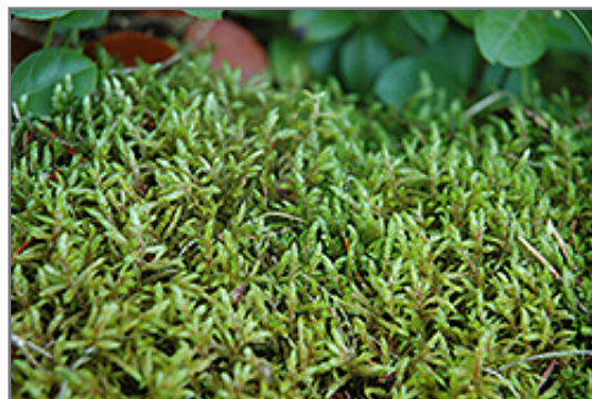
Ribbed Bog Moss foliage