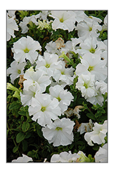
Paparazzi White Diamonds Petunia flowers