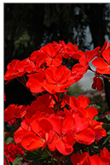
Fantasia Coral Geranium flowers