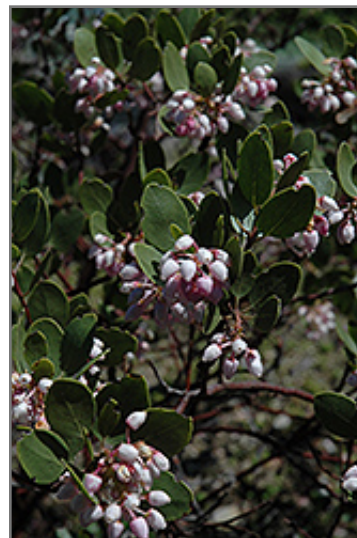
Common Manzanita flowers