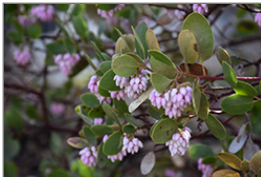
Common Manzanita flowers

This shrub does best in full sun to partial shade. It is very adaptable to both dry and moist growing conditions, but will not tolerate any standing water. It is very fussy about its soil conditions and must have sandy, acidic soils to ensure success, and is subject to chlorosis (yellowing) of the foliage in alkaline soils, and is able to handle environmental salt. It is somewhat tolerant of urban pollution. This species is native to parts of North America.