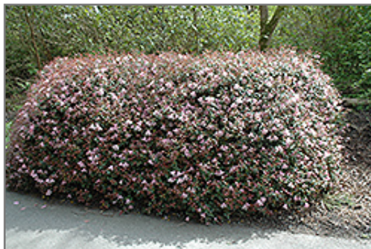
William's Rhododendron in bloom