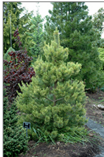
Gold Coin Scotch Pine

This is a relatively low maintenance tree. When pruning is necessary, it is recommended to only trim back the new growth of the current season, other than to remove any dieback. Deer don't particularly care for this plant and will usually leave it alone in favor of tastier treats. It has no significant negative characteristics.