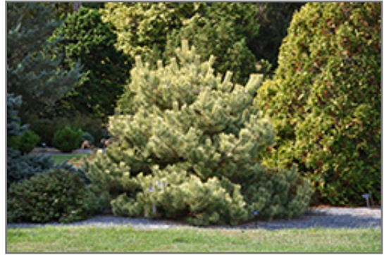
Gold Coin Scotch Pine

Gold Coin Scotch Pine will grow to be about 20 feet tall at maturity, with a spread of 15 feet. It has a low canopy with a typical clearance of 1 foot from the ground, and is suitable for planting under power lines. It grows at a medium rate, and under ideal conditions can be expected to live for 60 years or more.