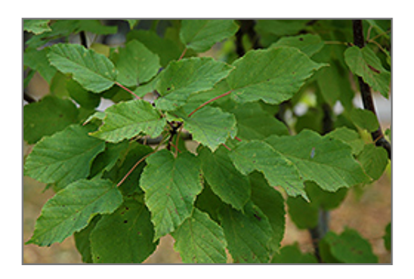
Pattern Perfect Tatarian Maple foliage

Pattern Perfect Tatarian Maple is recommended for the following landscape applications;