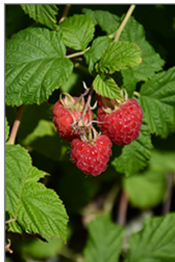
Raspberry Shortcake Raspberry fruit

Raspberry Shortcake Raspberry has rich green deciduous foliage on a plant with an upright spreading habit of growth. The textured oval compound leaves do not develop any appreciable fall color. It features an abundance of magnificent red berries in mid summer.