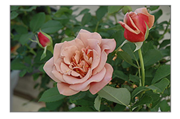
Koko Loko Rose flowers