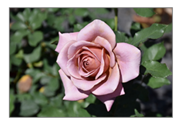
Koko Loko Rose flowers

Koko Loko Rose is recommended for the following landscape applications;