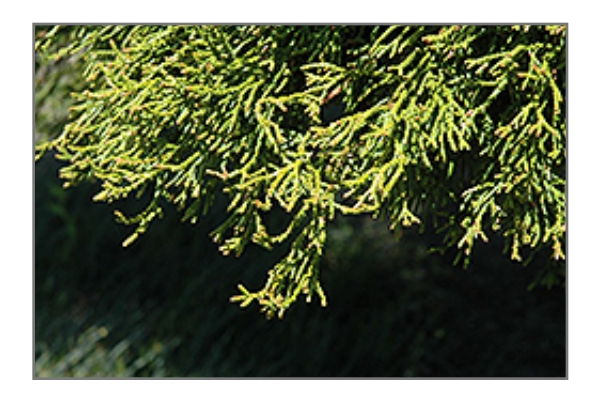
Coralliformis Dwarf Hinoki Falsecypress foliage

Coralliformis Dwarf Hinoki Falsecypress is recommended for the following landscape applications;